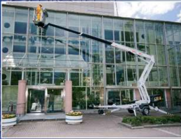
Long horizontal outreach with full load – ensures safe access to work positions.