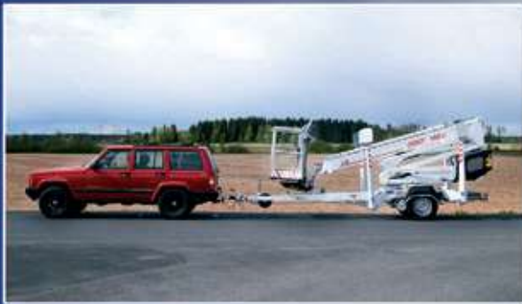
Compact and agile – easy to tow and move on site.