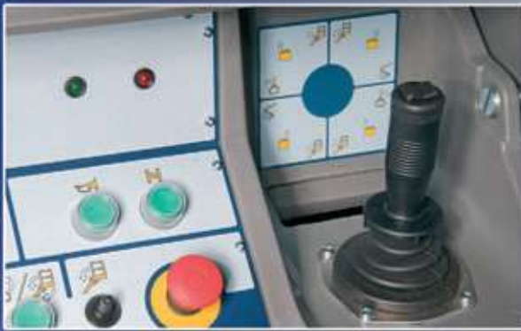
Proportional steering with one joystick – enables exact positioning of the platform.